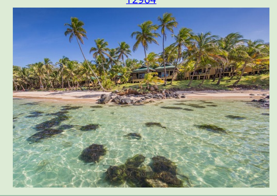
Hamurana Lodge Rotorua, New Zealand <u>T2858</u>